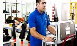
Rubber Goods ~40 mAac