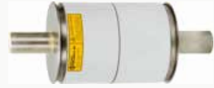
Vacuum Bottle ~5 - 10 mAac