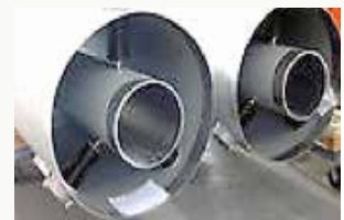
Iso Phase Buss ~0.5 - 1 Aac