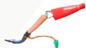
Shielded Power Cable ~5